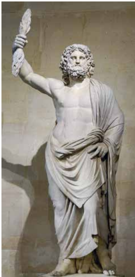
The oligarchical principle is premised on the supremacy of a class of persons regarded as virtual “gods,” “akin to such as the esteemed rulers of Wall Street and London presently.” The rest of us are treated as mere cattle, to be reared, harvested, or simply killed. Shown: Zeus, ruler of the Olympian “gods” (Roman, mid-Second Century A.D.; restored, 1686).

The essential character of the oligarchical system, and the characteristics of the oligarchs as individual per-