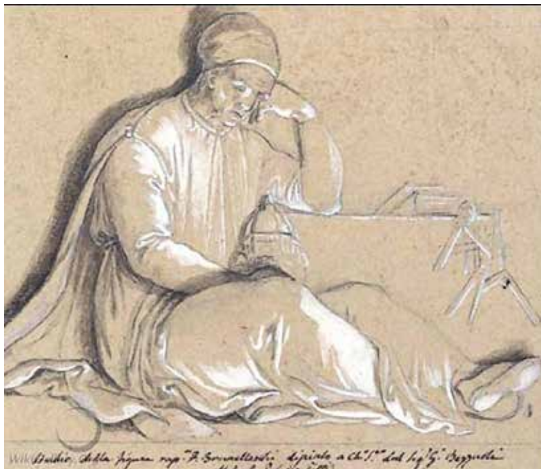
The 15th-Century works of Nicholas of Cusa and his follower Filippo Brunelleschi profoundly influenced the founders of the American Republic, notably its scientific genius Benjamin Franklin. Shown: Brunelleschi, holding a model of his creation, the Dome of Florence Cathedral (by Giuseppe Bezzuoli, early 19th Century).

Hence the habitual tendency of the oligarchy has been to suppress the general population’s access to serious forms of progress in competent advances in scientific knowledge, such as the conduct of the cult of the “environmentalists” acts to prevent both the development and spread of competent access to scientific knowledge. This has been an anti-scientific impulse of tyranny which is supplemented, from time to time by measures of explicit genocide, typified by the Hitler regime, or the Emperor Nero earlier, and by the impulses of President Barack Obama, as also typified by the British monarchy’s association with “Malthusianism” and Prince Philip’s shamelessly mass-murderous promotion of the World Wildlife Fund. Since that offshoot of the Confederacy which was Theodore Roosevelt brought the mental sickness of “environmentalism” into the practice of U.S. national law, especially since the assassinations of President John F. Kennedy and his brother Robert, the Anglo-American oligarchies have played an increasing role in destroying the conditions of scientific progress, which does conform to British imperial fancies, but not