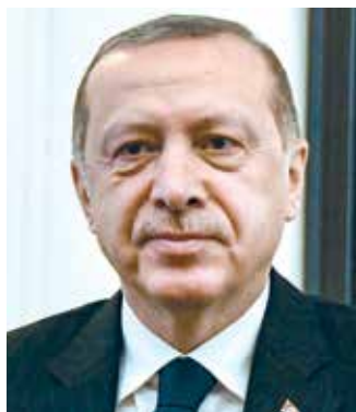
Recep Tayyip Erdoğan

Turkish Prime Minister Recep Tayyip Erdoğan spoke out against the demonizing of Russian art, literature, and performers that he has seen in Europe, the U.S. and elsewhere, during his opening address March 11 to the three-day Antalya Diplomacy Forum in southern Turkey. Anadolu Agency reported that Erdoğan referred to Ukraine’s situation as a “legitimate struggle” against Russia, but he nevertheless condemned the anti-Russia “witch hunt.” He said,