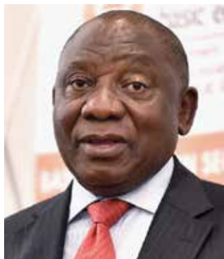
Cyril Ramaphosa

The war [in Ukraine] could have been avoided if NATO had heeded the warnings from amongst its own leaders and officials over the years that its eastward expansion would lead to greater, not less, instability in the region.