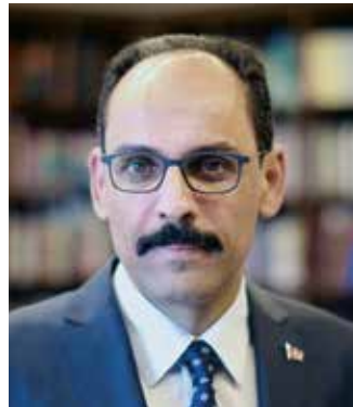
Ibrahim Kalin

The views of Ibrahim Kalin, a top adviser to Turkish President Recep Tayyip Erdoğan, were presented at some length in a March 19 New Yorker interview, from the standpoint of Kalin having been present for Erdoğan’s March 17 calls to Presidents Putin and Zelenskyy. Kalin stressed the importance of thinking how to manage relations with Russia, once the warfare stops: