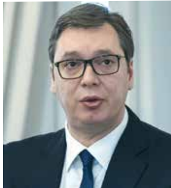
Aleksandar Vučić

I believe that Serbia must not join NATO. Serbia is a free country and a militarily neutral country. Serbia will be defending its land and its sky on its own.