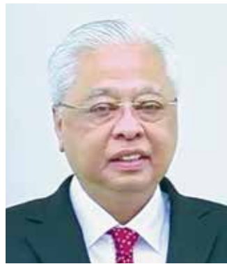
Ismail Sabri Yaakob

Malaysian Prime Minister Ismail Sabri Yaakob, upon his return March 22 from an official visit to Hanoi, reported to Bernama news agency that he and his Vietnamese counterpart, Pham Minh Chinh, had discussed the Russia-Ukraine conflict, and—