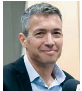
Yoaz Hendel

Ukrainian President Volodymyr Zelenskyy’s video address to the Israeli Knesset March 20 drew ire from lawmakers and newspapers in Israel who objected to his comparison of Ukraine’s situation today to that of the Holocaust, especially because Nazi collaborator Stepan Bandera, who participated in carrying out that Holocaust, has been reborn as a national hero under Zelenskyy’s government.