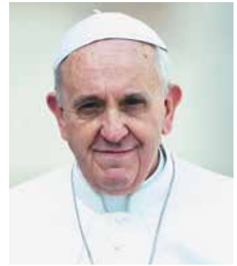
Pope Francis

that still dominates the so-called geopolitics. The history of the last 70 years proves it: regional wars have never lacked; that's why I said we were in the third world war in bits and pieces, a bit everywhere; up to this one, which has a bigger dimension and threatens the whole