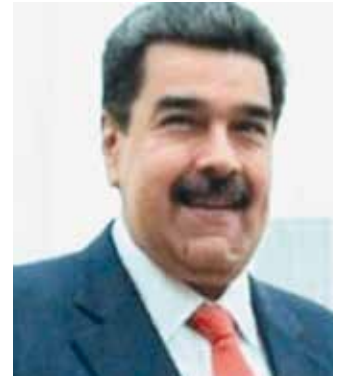
Nicolas Maduro

Five developing countries that have begun to build the architecture of financial, economic, commercial and political cooperation are striving to become one of the main actors in the emerging world. The Venezuelan state is prohibited from using the dollar. International exchange currency cannot be used in geopolitical or political blackmail! It must be a stable currency that can withstand any circumstances of world conflict, whatever they may be, and be respected. To which all countries of the world have equal access. This should be a new unified system.