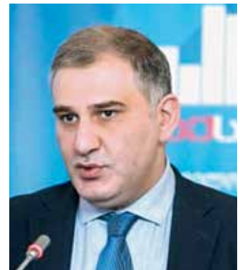
Mikheil Sarjveladze

The Georgian government in Tbilisi has taken a negative stance on an appeal from Ukraine Security Council Secretary Oleksiy Danilov calling on Georgia and Moldova to open a “second front” against Russia, as reported March 28 by Interfax. Georgia has also rejected sanctions against Russia, as well as the supplying of weapons to Ukraine, and has banned the recruitment of Georgian volunteers to fight on the Ukrainian side in this war.