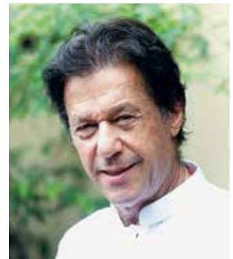
Official photo Imran Khan

Pakistan’s Prime Minister Imran Khan has been steering a diplomatic course for peace-through-development, working with Russia, China, and the Organization of Islamic Cooperation, in particular on regional connectivity in Central and South Asia, and is directly now a target for ouster by the U.S. and the Global NATO bloc. On April 1, Khan announced that his government had just “given a démarche to the American embassy,” protesting its blatant interference