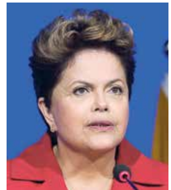
Dilma Rousseff

Former Brazilian President Dilma Rousseff gave the keynote address at a March 19 seminar on China and Latin America, sponsored by the Friends of Socialist China. She identified the fight between finance capital’s neoliberalism and the “shared development” paradigm championed by China as the choice before the world. While mostly speaking of economic matters, she did zero in on the Ukraine crisis.