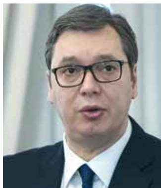
Aleksandar Vučić

Serbian President Aleksandar Vučić stated in an interview March 27 with Serbian broadcaster TV Prva, as reported by Sputnik, that Western demands for Serbia to support sanctions against Russia are unfair, since the country is a sovereign state, is not a member of the European Union, and has itself survived foreign aggression by NATO forces in 1999. Vučić emphasized that Belgrade will continue to act in its own sovereign interests, even if that runs counter to other nations' desires: