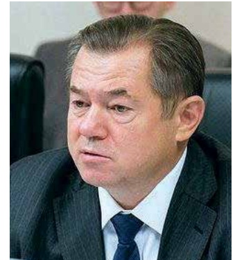
Council.gov.ru Sergei Glazyev

The resources and technologies available in the world make it possible to produce food for 20