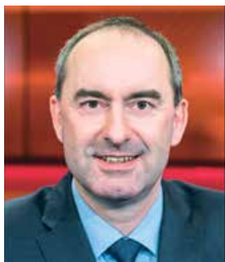
Hubert Aiwanger

Gas is still coming from Russia, and I say quite officially and emphatically: Thank God gas is still coming from Russia. [Around 220,000 jobs in Bavaria] depend relatively directly on Russian gas imports.