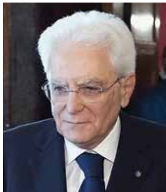
President Sergio Mattarella

Speaking April 27 before the Council of Europe, Italian President Sergio Mattarella harshly condemned Russia and supported sanctions, as he has before, but then called upon the international community “to obtain a ceasefire and restart with the construction of a respectful and shared international framework that leads to peace.” To accomplish this, he