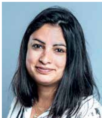
Nooshi Dadgostar

In a dramatic turn, Swedish Left Party leader Nooshi Dadgostar on Swedish Public Radio news April 28 said “no” to NATO membership for Sweden and demanded a referendum. She raised the issue of keeping nuclear weapons out of Sweden, which strategically is the big issue, as NATO membership for Sweden and Finland could lead to a Cuban missile crisis in reverse in Northern Europe.