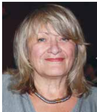
Alice Schwarzer

If Germany delivers offensive weapons to Ukraine, “We must ask ourselves whether we are not escalating the drama,” leading German feminist Alice Schwarzer, the initiator of the April 29 Open Letter urging Scholz to take the lead in diplomatic negotiations, rather than pumping weapons into Ukraine, told Deutschlandfunk radio May 2. The danger of getting into a Third World War is real, she said, adding: