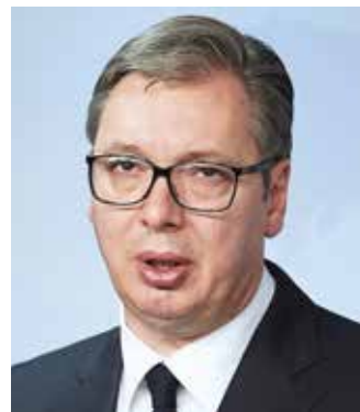
Aleksandar Vučić

In a special address to the nation May 6, Serbia's President Aleksandar Vučić said his country will not join NATO: "Serbia is a neutral country and it will remain militarily neutral, if there is no majority in favor of a different decision. I will support military neutrality," Vučić said, despite the fact that nearly all of Serbia's neighbors are NATO members. "It is our wish to stay out of NATO and we will retain this status."