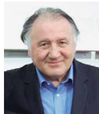
Peter Weibel

The signers of the Open Letter to German Chancellor Olaf Scholz, calling for negotiations over Ukraine, and for putting a stop to sending heavy arms, are coming under heavy attack. But they are striking back.