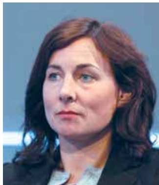
Juli Zeh

Signer Juli Zeh defended her signature, warning in a May 3 interview with the Die Zeit weekly, that every single day that this war continues increases the risk of escalation and can lead to a "worst-case scenario for Europe and