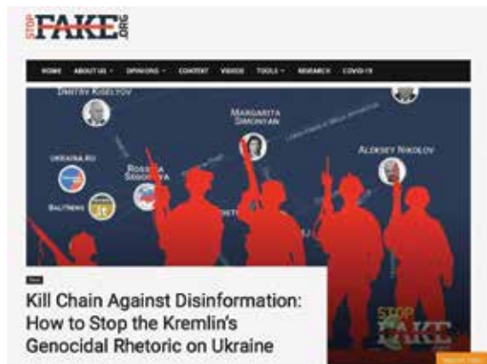
StopFake, an official fact-checker for Facebook, is manned by Azov Battalion supporters.

This goes back to a phenomenon known as “Synarchism,” the hidden background to the nihilism of Nazism in the 20th Century. Investigations done by military and intelligence circles in President Franklin