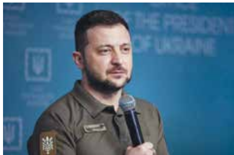
Office of the President