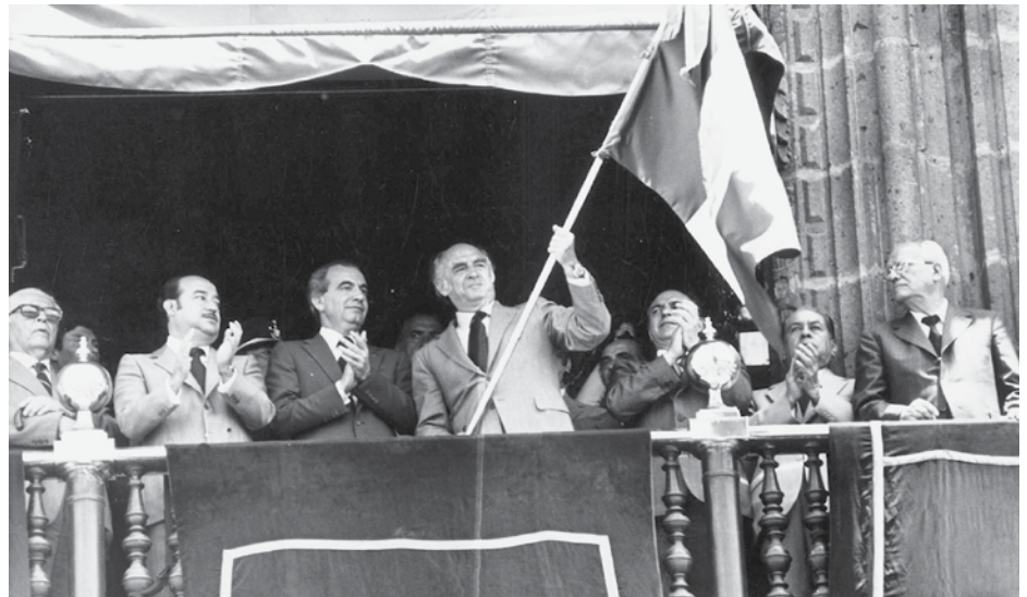
Gobierno de México

Overnight, the military forces of Mexico were posi-