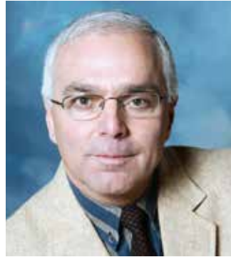
National Catholic Reporter

list: “You lie for notoriety and self-promotion. Worse yet, as an agent of Russian disinformation, you promote Russian aggression and endanger America. You have picked a side. Your side is Russia and authoritarianism.”