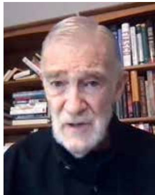
The LaRouche Organization