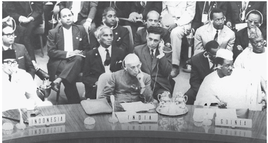
The spirit of Bandung has come alive again in the idea of non-violence. Shown, leaders of the Non-Aligned Movement of nations in conference, determined to end colonialism in all its forms. Bandung, Indonesia, April 1955.

We expanded the original plan of the Eurasian Land-Bridge and all the other development plans we had written, into the concept of “The New Silk Road Becomes the World Land-Bridge,” which has now begun to be implemented by China with