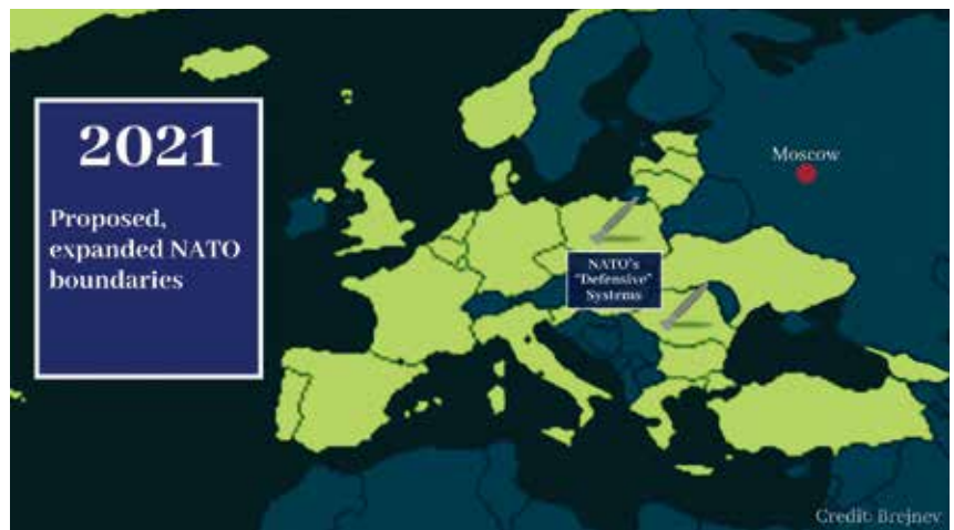
The proposed boundaries of an expanded NATO, as of 2021.

and military power of the U.S. and Great Britain, which the Wolfowitz doctrine says can’t be permitted. But even more fundamental is the fact that the neo-liberal model of the trans-Atlantic world is in a systemic breakdown. We are exactly at the point which was forecast by Lyndon LaRouche, my late husband, more than 50 years ago, when [President Richard] Nixon ended the Bretton Woods system by moving from fixed to floating exchange rates. And in this way, opening the floodgates to the unbridled free trade system of profit maximiza-