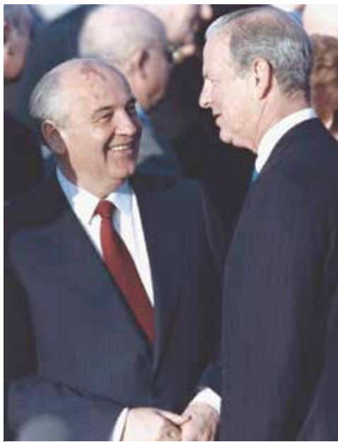
U.S. Secretary of State James Baker III (right) lied to Soviet leader Mikhail Gorbachev: “NATO will not extend one inch eastward.” Moscow, February 1990.

In the meantime, there is open talk about the destruction of Russia, or, as former White House National Security Advisor John Bolton is saying about Putin, that he is a “legitimate military target who is on our target list at this point.” Meaning, he wants him assassinated. To threaten the destruction of a country, [President Vladimir] Putin said very clearly, the aim is to cut Russia into three, four, or more states; to threaten the assassination of the head of state; to have the de facto participation of U.S. and NATO troops in the fighting in Ukraine; provide cyber intelligence to the Ukrainian military; train Ukrainian troops on the U.S. military bases in Germany. All of that means we are already in a war between NATO and Russia.