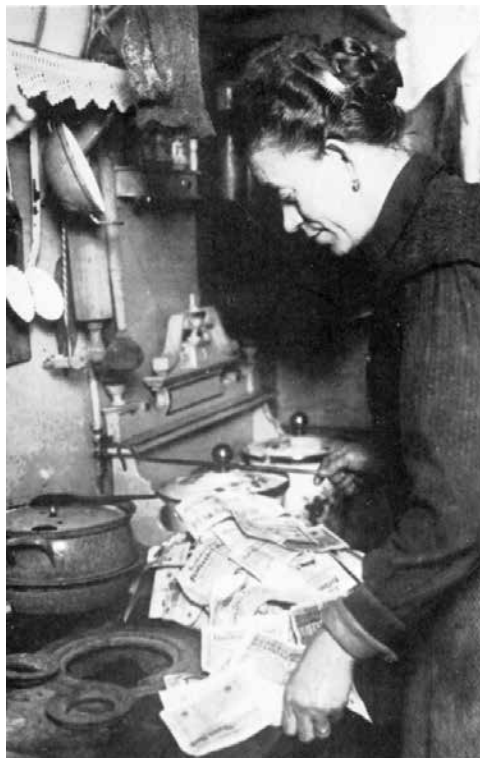
A German housewife burns money made worthless to heat her cooking stove in the post-World War I hyperinflation in 1923.

This is what the LaRouche movement has been about from the very beginning: to overcome the poverty and under-development of the countries of the Global South as a morally unacceptable relic and continuation of colonialism in new clothes. When Lyndon LaRouche was serving in the China-Burma-India theater at the end of the Second World War, he witnessed the brutish behavior of the British in the Winter and Spring of 1946 in the riots in Kolkata, where he saw the