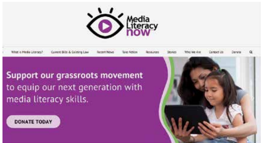
“Combating disinformation” in U.S. schools is the self-assumed task of the Media Literacy Now group.

If you take that together with another atrocity, namely the EU guideline for teachers, whereby they’re supposed to “pre-bunk” pupils, that is, children, against Russian propaganda. Now, “debunking” means if somebody says something bad, you can always debunk it: You say, “This is not true,” and say what you think is the truth. But “pre-bunking” means that you inoculate people in such a way that they don’t even