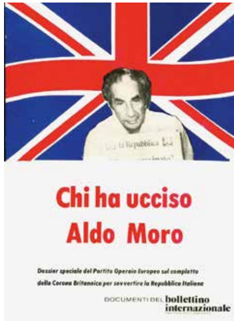
German Workers’ Party Who Killed Aldo Moro, a dossier published in 1978 by LaRouche’s co-thinker organization in Italy on the British plot to subvert the Italian Republic.