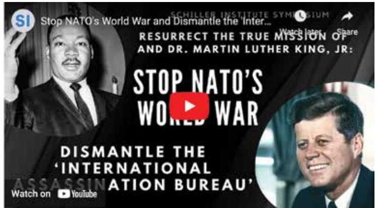
The Schiller Institute sponsored the Jan. 14 international online symposium.

of Eastern Europe through the Council for Mutual Economic Assistance (COMECON). NATO did the same thing in Western Europe, but needed the illusion of national independence, sovereignty, and democracy. The Ukraine war has dispelled this illusion, “lifted the veil.” The trans-Atlantic elites take a view of the citizenry that is no different from the way Prince Harry viewed his Afghan victims, through the sights of his helicopter gunship: they are not regarded as human. These elites feel now that they must stifle dissent in the media and social media, but this is a basis for optimism, because it demonstrates that they are afraid. “The U.S.