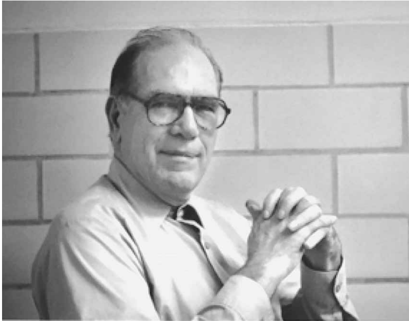
Lyndon H. LaRouche, Jr.

nurture that quality of potential for discovery in the child, is true love. Creative activity is human activity, and the emotion associated with that kind of activity, is true love.