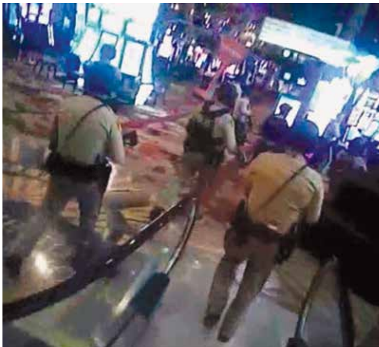
Las Vegas Metropolitan Police Department

It's also the case that since 9/11, young people in the U.S. military have been deployed as killers in wars in Southwest Asia, with a probably very conservative estimate of 937,000 people overall, 387,073 of them civilians, dying violent deaths as a direct result of combat operations in post-9/11 war zones. As of May 2023, an estimated 3.6-3.7 million people have died indirectly. The total death toll in these war