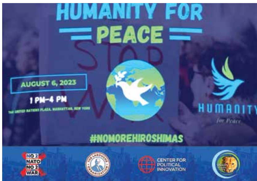
Home page of the Humanity for Peace website, advertising its August 6, 2023 rally at United Nations Plaza in New York City.

Zepp-LaRouche pointed to the newly announced decision by President Joe Biden to deploy cluster