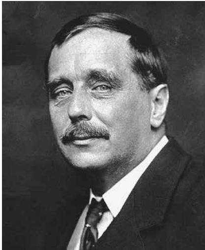
H.G. Wells