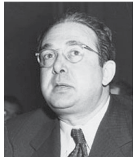
Dr. Leo Szilard

Circa 1928, Bertrand Russell publicly declared his reconciliation with H.G. Wells, and with Wells' current book, The Open Conspiracy , Wells' world-government plot. 4 From that time on, Russell became the leading spokesman for Wells' policy of world-government through terror of nuclear weapons. Russell, aided by his assets N. Bohr, Leo Szilard, and Eugene Wigner, became the principal organizer of the actual development of nuclear-fission weapons by the U.S.A., Canada, and the U.K. Russell became also the designer of the doctrine of world-government through arms-control. Russell's doctrine, as presented by Russell's lackey Leo Szilard, became the doctrine of the U.S. government, as pushed by the Pugwash Conference organization, and by John J. McCloy, McGeorge Bundy, Henry A. Kissinger, et al.