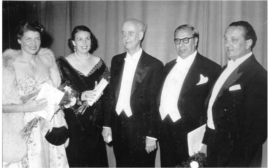
Conductor Wilhelm Furtwängler (center) with the soloists for a performance of Beethoven’s Choral Symphony (the Ninth) in Bayreuth in 1954.

Remember, we are at the point that this whole system, the whole United States system in its present form, is ready to disintegrate. And the only way you’re going to prevent a disintegration of the United States, is by learning to place your voice properly. We’re at a point of real desolation, of all hope for mankind under the present global conditions. There are parts of China,