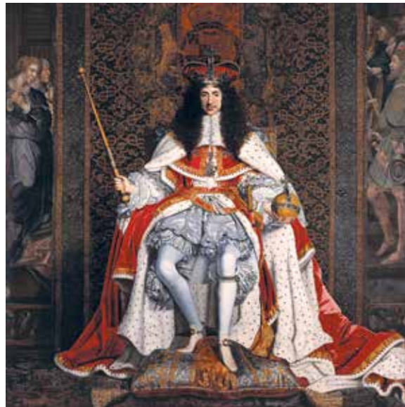
John Michael Wright Coronation portrait of Charles II, King of England, 1660.

country. Imperial powers always wish to keep their colonies as shippers of raw materials, while monopolizing manufacturing for themselves. But by 1647, the Saugus Iron Works in Massachusetts was outproducing any such mill in England.