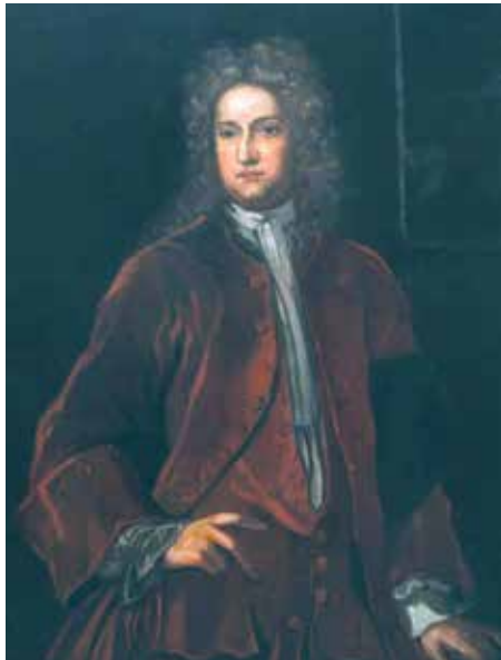
L.T. Montague (after Sir Peter Lely) Sir William Berkeley, Governor of Virginia. About 1663.

• 1661–62: At the same time, a drive for freedom is escalating. The General Court of Connecticut, rightly worried about the possibility of revocation of its liberties, sends their Governor, John Winthrop, Jr. (son of Massachusetts’ John Winthrop) to England with £500 credit. With the aid of a few sympathetic Lords, Winthrop is able to secure the “Royal Charter of 1662,” which gives the Connecticut Colony an unprecedented degree of self-governance, almost completely independent of English influence, and merges the disparate plantations throughout the territory of Connecticut