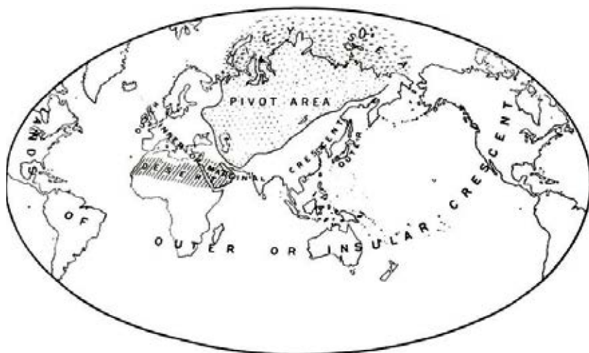
Geographical Journal Vol. 23, No. 4, April 1904

This tactic was enthusiastically supported by National Security Advisor Zbigniew Brzezinski, and