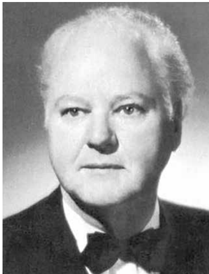
Public domain/book print ad

Let me give you an illustration. Mr. Hunt and [H.L.'s son, Nelson] Bunker [Hunt], they were trying to get a concession in Kuwait. Oil concession. Well, how many major oil companies do you think, any time there's an oil concession coming up for the richest oil field in the world,