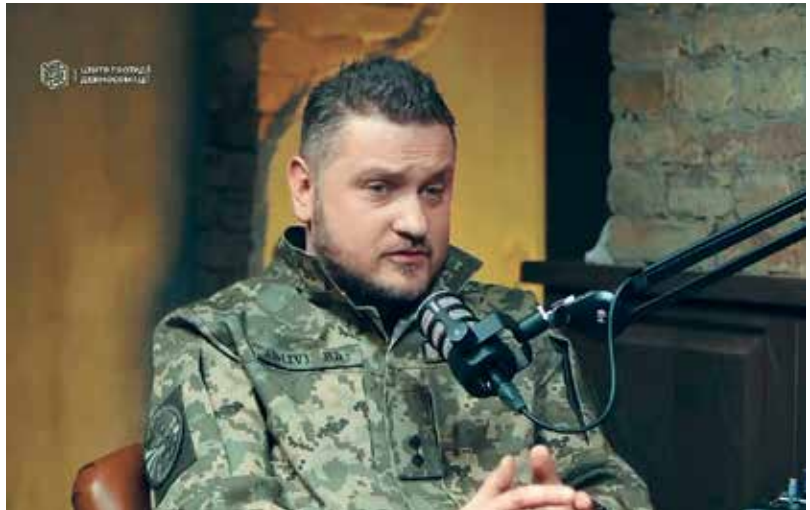
Screenshot from CCD YouTube channel

On Feb. 9, VoxCheck, the “fact-checking” project of VoxUkraine, an outfit in USAID’s network of “countering-disinformation” operations , posted an article , with an accompanying flowchart, which purported to identify “a network of pro-Russian disinformation” practitioners formed by 26 “Western ‘experts’” whose activities are a “danger.” Each of the experts named in this so-called “network” had been fingered