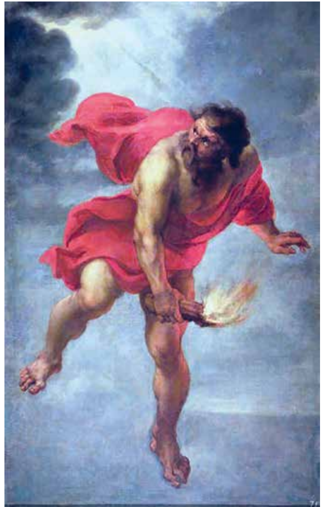
“The new mission of Prometheus must be brought forth, promptly, now,” LaRouche writes. “The present crisis-situation demands it.” Shown: Prometheus takes fire from the gods, to bring to man, by Jan Cossiers, 17th Century.