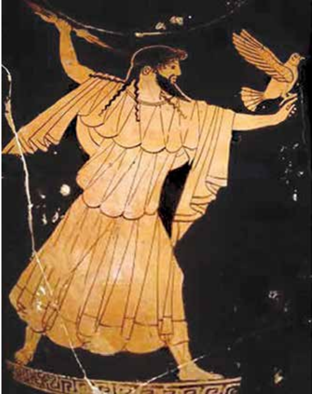
“The followers of Zeus, are, intrinsically, self-doomed to a probable species-extinction in the presently looming, nuclear-warfare-like prospects for the future of mankind.” Shown: Zeus with his eagle and thunderbolt, Athenian red-figure amphora, 5th Century B.C.