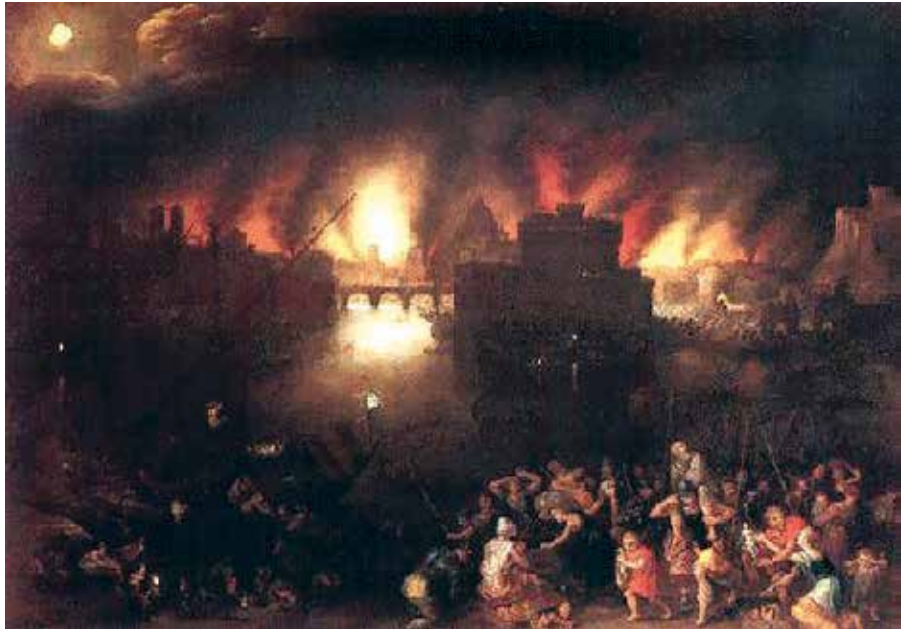
The destruction of Troy (12th/13th Century B.C.) is the archetype for the brutal population-reduction policies of the oligarchy, typified today by the British royal family and its greenie shock troops. Shown: Jan Brueghel the Elder, “The Burning of Troy” (1621).

Similarly, the case of Thomas Jefferson’s disgusting departure from the original Presidency, and of the British monarchy’s official murderer Aaron Burr, typify the various mere scoundrels, such as the renegade Thomas Jefferson of his wicked days, on the one hand, and his sometimes sympathetic rival and accomplice, the British hired murderer, Aaron Burr on the other, who was the sponsor of both U.S. Presidents Andrew Jackson and Martin Van Buren, the latter pair