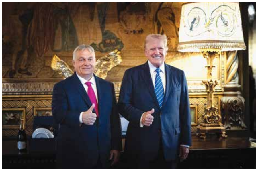
Viktor Orbán Facebook page

Given the uncertainties surrounding the assassination attempt against Trump, and the long history