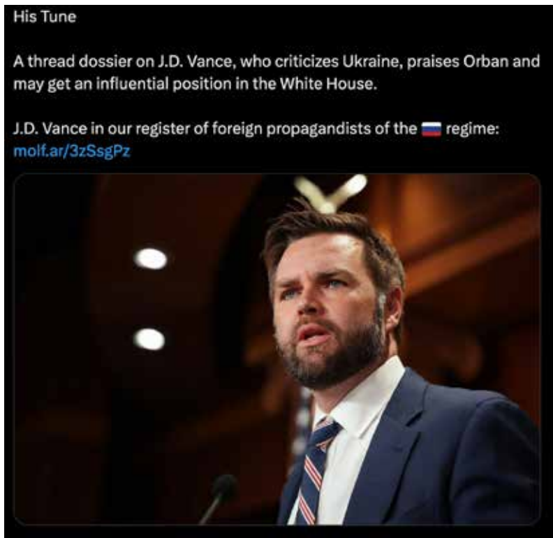
Molfar X page