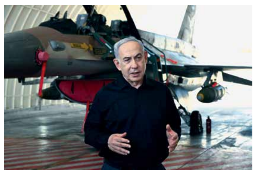
Benjamin Netanyahu Facebook page

I think the situation in Southwest Asia is absolutely horrible, because Secretary of State Antony Blinken's so-called shuttle diplomacy expectedly led to nothing. He left and, basically, had capitulated to Israeli Prime Minister Benjamin Netanyahu, who seems to