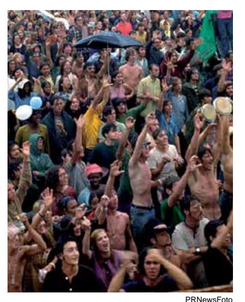
The Woodstock Music Festival, an example of the rock-drugs-sex counterculture, which Lyndon LaRouche said would cause the long-term erosion of the American economy's productivity.

We have a question from a U.S. contact, who says, "The last two International Peace Coalition meetings have been inspiring. How can we increase the reach of the crucial work you're doing? I believe the suppression of the freedom of speech, through censorship and disinformation, is the greatest threat to America, and undercuts the work you are doing. How do we fight this?"