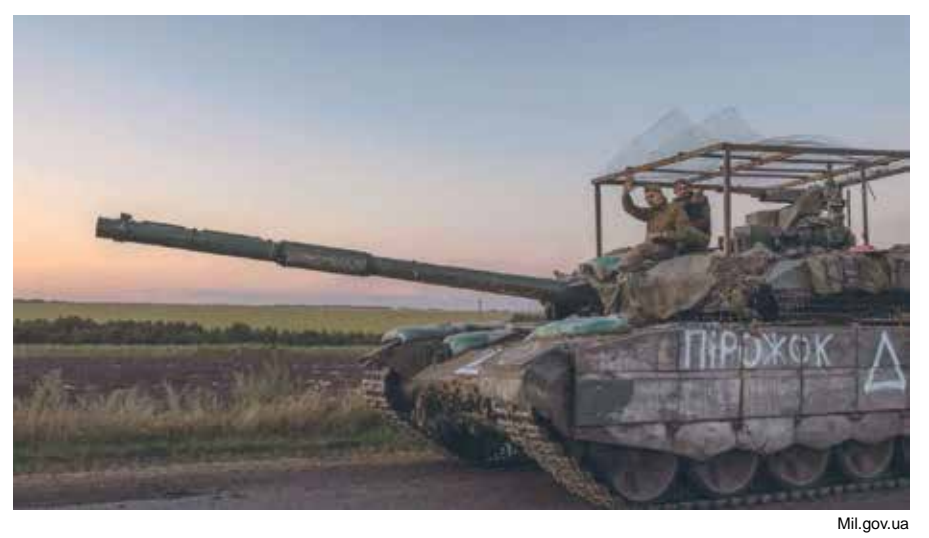
Ukrainian soldiers on deployment. The Kursk invasion has made NATO's direct involvement to defeat Russia undeniably clear.

Helga Zepp-LaRouche: I think it's definitely useful and extremely urgent. I think the first step to avoid catastrophe is that the populations all over the world, not just on both sides of the Atlantic, but emphatically also in the Global South, wake up to the ab-