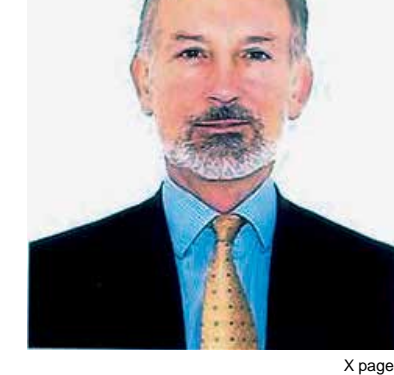
Russian Foreign Minister Sergey Lavrov