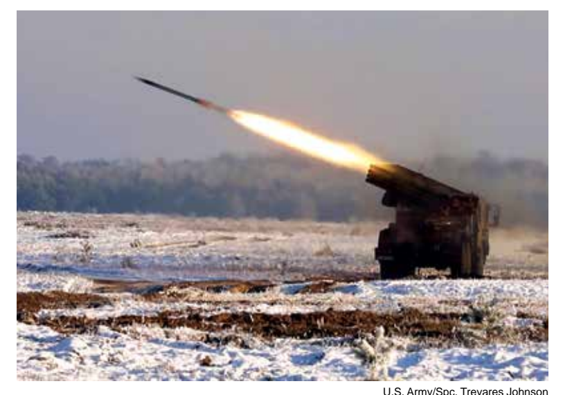
A truck-fired missile launch in Germany. "Allied" NATO deployment of long-range missiles on its German soil will make it a Russian target.

ments, that Ukraine would have something to bargain with, in terms of territory occupied by Ukraine inside Russia.