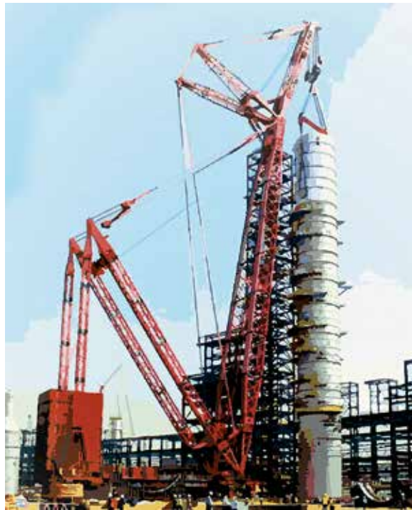
The world's largest distillation column being erected at the Dangote refinery in Lekki, Nigeria, just east of Lagos.

The Dangote Refinery—a subsidiary of Dangote Industries Limited—is truly the “seventh wonder” of Africa. Its 650,000 barrels per day (bpd) of refined petroleum products—everything from cooking gas to auto fuels—can provide Nigeria’s entire domestic needs and export to the region as well. Its current output is 300,000 bpd, but is on its way up to full capacity. Staffed 93% by young Nigerians, the refinery also provides on-the-job training in the operation of a large, technology-intensive business. As such, Dangote’s $20 billion venture became not only a financial market-moving enterprise, but one which could ruin the Lon-