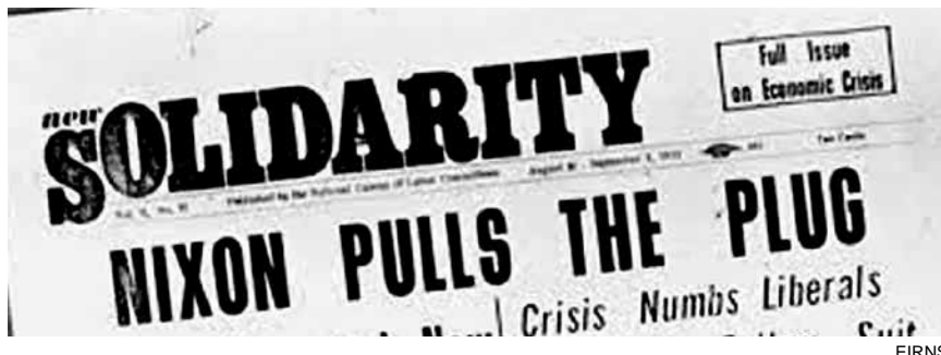
An early September 1971 headline in the LaRouche movement's newspaper at the time, addressing the end of the Bretton Woods system, which LaRouche had forecast.

Very few people, then or today, know who Hjalmar Schacht was. He was not only one of the point men for the corporate oligarchs in carrying out a shift in the world economy—in his case in the 1920s, '30s, and '40s—but he also became the economics minister for German Chancellor Adolf Hitler. Hitler was a controlled operative of British and New York corporate financiers, such as the head of the Bank of England, Sir Montagu Norman, the Rothschilds, the Rockefeller interests, and so on. These were operatives from the same networks that Shultz and Volcker worked for. Their approach neglected the real problem—that the economy could not afford guns and butter; that the spending on the Vietnam War and Lyndon Johnson's "Great Society" programs required the printing of money to fund them, which was inflationary. Instead of advocating an end to the Vietnam War and investing in upgrading the physical economy of the U.S., the Schachtian approach was to impose brutal austerity.