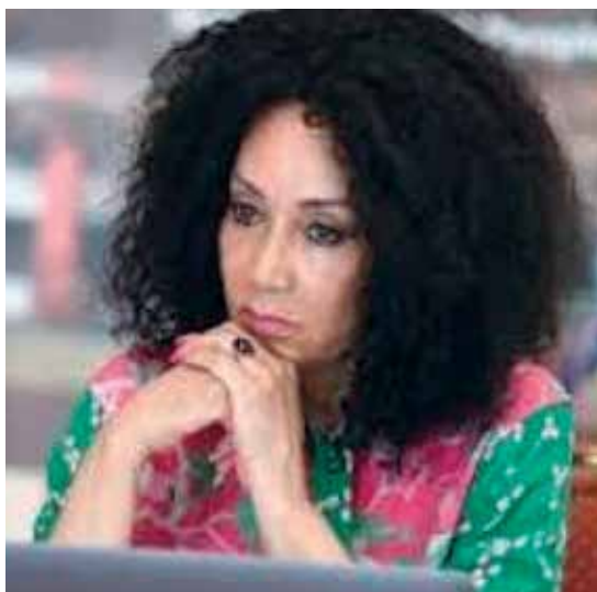
Lindiwe Sisulu Facebook page

As Pan-Africanists and as a non-aligned progressive party and peace advocates, the MK Party, under the leadership of President Jacob Zuma, condemns these dangerous provocations by NATO and the West. President Zuma has consistently opposed the militarization of global conflicts, stating, "Africa must reject war and choose diplomacy. The risk of nuclear conflict