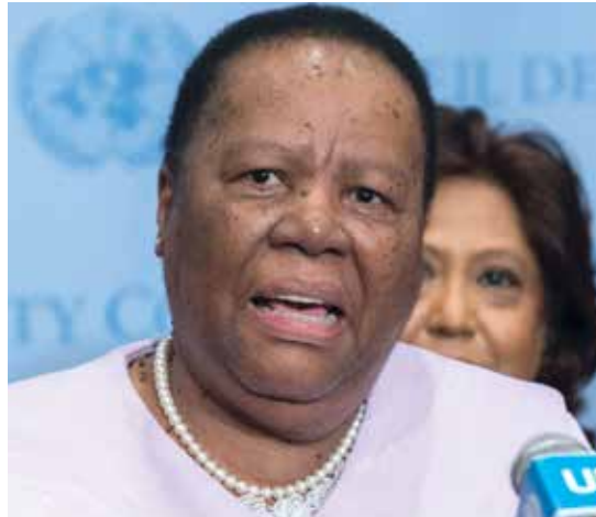
Dr. Naledi Pandor, former South African minister of international relations who took Israel’s government to the International Court of Justice.