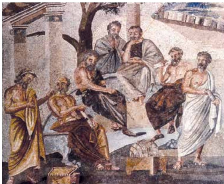
A mosaic from the ruins of Pompeii depicting Plato's Academy.

Where did mankind find the cultivated species and varieties of fruits and vegetables, upon which our lives and those of our livestock chiefly depend today? An important question; to discuss history without considering the answer, is a contradiction in terms. In 1982, I was hosted for several hours by the New Delhi agricultural research center, where important aspects of that part of history are kept as living and other evidence.