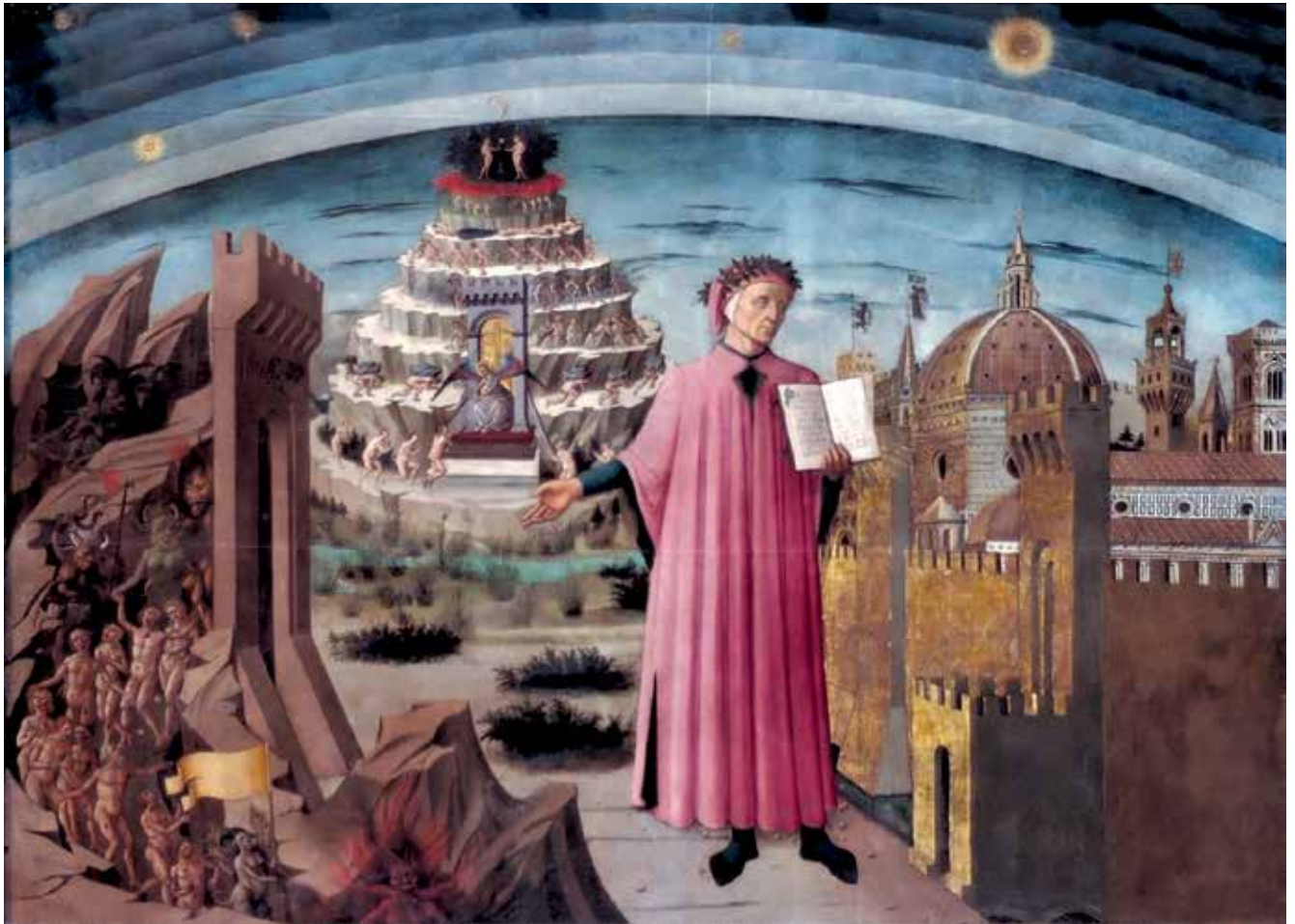
Dante In Purgatory, a painting by Domenico di Michelino after Alesso Baldovinetti.

left to the Golden Renaissance to solve.