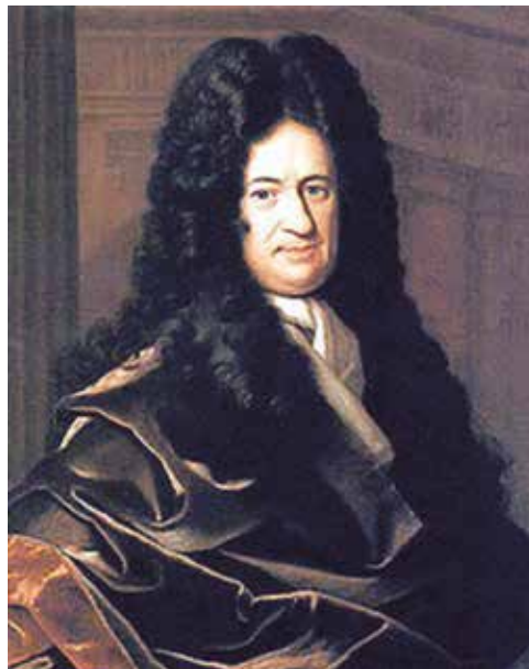
Gottfried Leibniz by Christoph Bernhard Francke.

problem posed by multiply-connected manifolds. 11 The characteristic of all human history (and pre-history), is a principle of action of this general class. It is only from this standpoint, that the crucial historical implications of the 233-231 B.C. attempt at circumnavigation can be adequately appreciated.