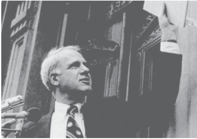
U.S. Department of Energy

James R. Schlesinger, U.S. Secretary of Energy, Chair of the Atomic Energy Commission, Director of the CIA, Secretary of Defense and a prolific writer on economics.