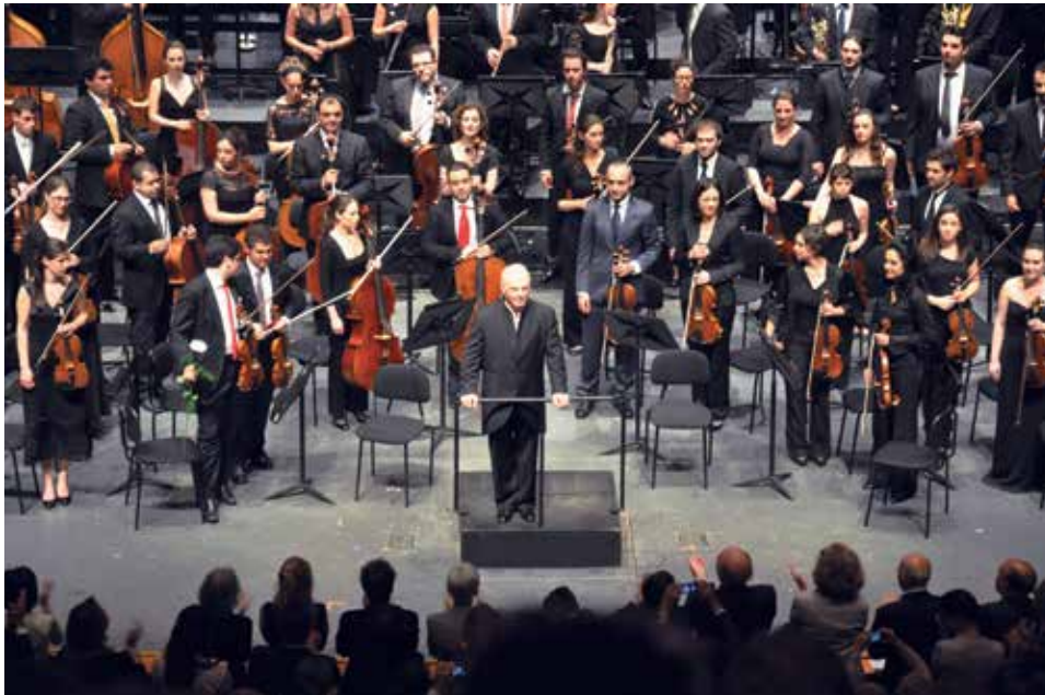
The West-Eastern Divan orchestra, established in 1999 by Argentine-Israeli conductor Daniel Barenboim and the late Palestinian-American academic Edward Said, to promote harmony in the war-torn Middle East region. Here, Barenboim with the orchestra in Salzburg, Austria in May 2013.

were being thrown into the water to be drowned or to be killed otherwise, and the leaders of Germany moved , together with Putin, to try to remove this problem and correct this error.