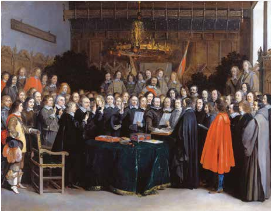
The conclusion of the Peace of Westphalia in 1648 marked the end of the orgy of blood called the Thirty Years War, and established the principle of nation states collaborating for the “benefit of the other.” This painting by Dutch artist Gerard ter Borch shows the ratification of the Treaty of Münster which finalized the agreement.