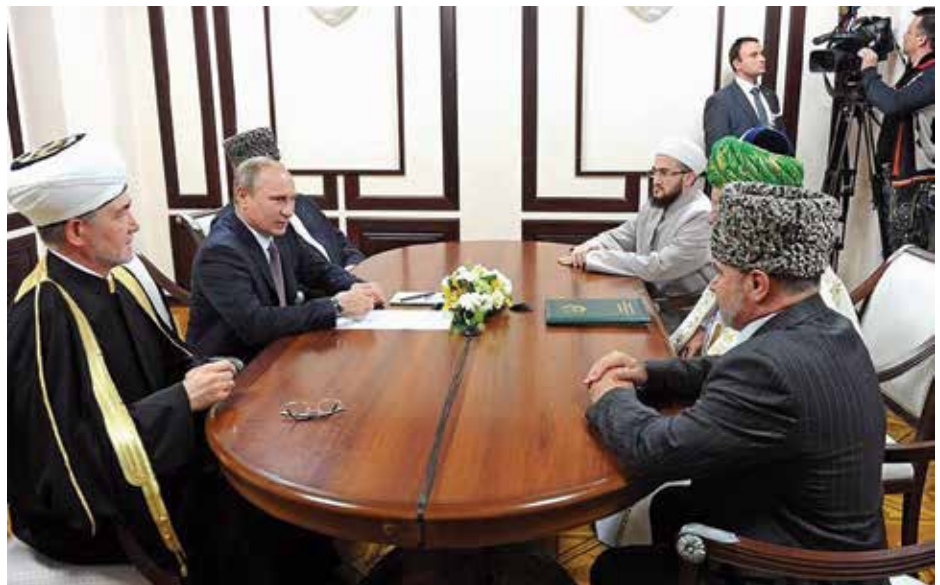
Seeking harmony among cultures: President Vladimir Putin, in the center on the left side of the table, conducts a dialogue with Russia's Muslim spiritual administrations in October 2013.

Now I think the options are good. They're not guaranteed, but we have enough good options, to know that it is possible to pull something off like this now. It may