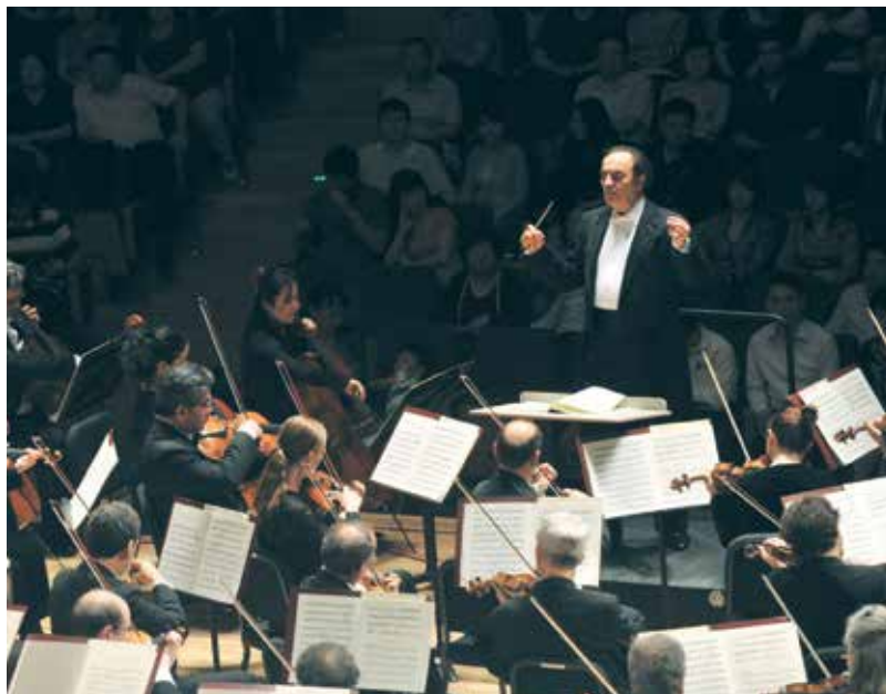
Charles Dutoit and the Philadelphia Orchestra at a concert in Tianjin, China in June 2012.

We have to be concerned about the strange superpowers of the so-called ISIS thing, and why it continues to expand. We are told that there there's a coalition out there that's fighting ISIS; we had the Kurds that won