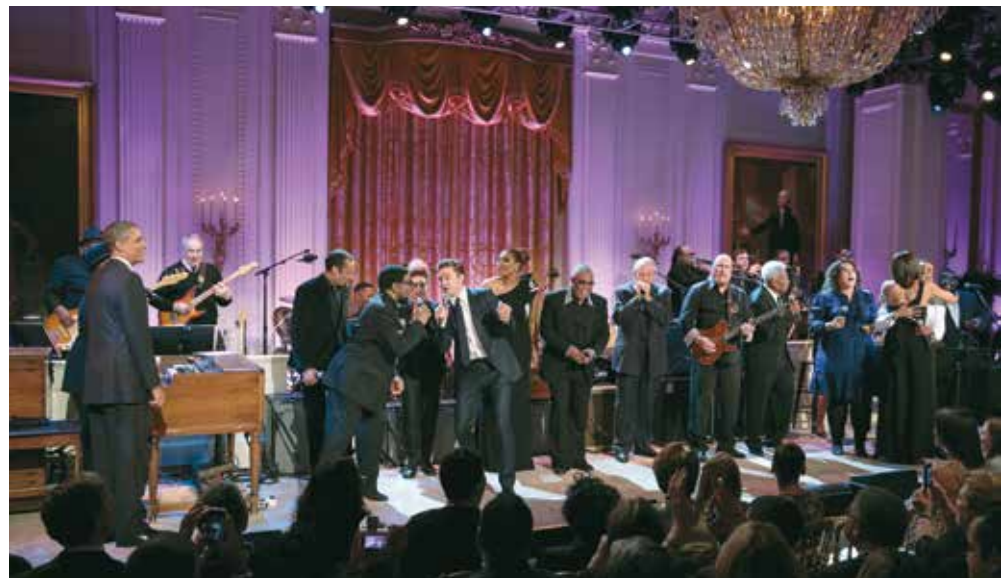
Dissonance in the White House: Obama presides over a "Memphis Soul" performance in the East Room in April 2013.

Well, we were talking about this new Manhattan Project that would not be a destructive A-bomb, but would be to get nuclear energy on the table, to actually come together with scientists to produce this new amount of energy that we're going to need to power New York City. People are afraid of this "nuclear" word, nuclear energy. And I just thought about it for a minute, and I'd like you to kind of put in perspective why there is such a fear of the idea of nuclear energy. I know that with the Cold War and all that business, we were brainwashed into thinking that "nuclear" means