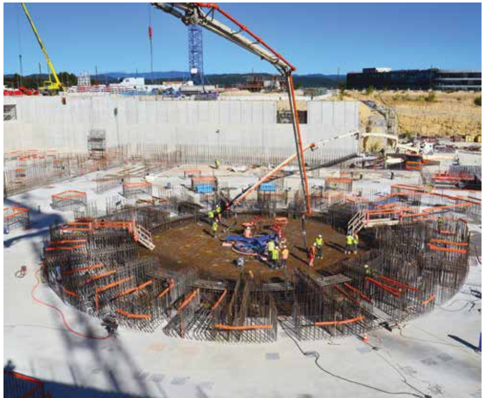
Harmony among nations: The construction of the floor of the Tokamak pit at the International Thermonuclear Experimental Reactor (ITER) site in southern France. The work is being conducted by scientists and engineers from the European Union, China, Russia, Japan, India, South Korea, and the United States.

Then we got into a later period, where that whole thing has no capability of surviving; no intrinsic ability