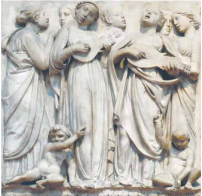
One of the panels sculpted in the 1430s by Luca della Robbia to decorate the singers' gallery in the cathedral of Florence, a jewel of the Italian Renaissance.