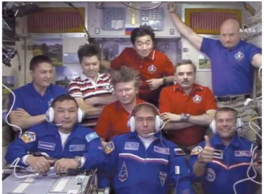
Harmony in action: Astronauts currently on the International Space Station. This picture was released this September in connection with the visit of the first Dane in space, Andreas Mogensen, seen bottom right.

LaRouche: Look, the best thing is—you've got to bring people into,—or some people at least,—you've got to bring them into harmony. And therefore, while they may retain different particular characteristics in their behavior, the point is that there must be a harmonious relationship. And that's what we're seeing right now with Russia's intrusion, in trying to save part of this whole area, which includes Turkey. We have to do that. It's an obligation. It's a moral one. And my view is, we have the potential in the fairly short term, of possibly bringing about a general peace throughout the planet. That is now possible. It doesn't mean it's guaranteed, but it means the winds are blowing in that direction. The question is whether we can keep the windstorm going up.