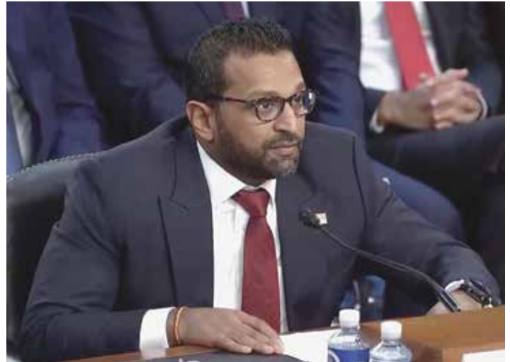
U.S. Senate Judiciary Committee Facebook