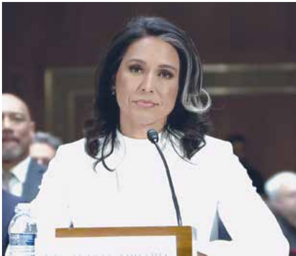
U.S. Senate Select Committee on Intelligence

function, and there is a need “to be challenged and re-constructed.” He said he believed Gabbard and Patel were the kind of fighters the American people need to root out the “rot” in the “Deep State.” In their responses to the at-times harsh grilling they were subjected to by some of the Senators who will determine their fate, both demonstrated the toughness that Trump expects of them, to fulfill their assignments.