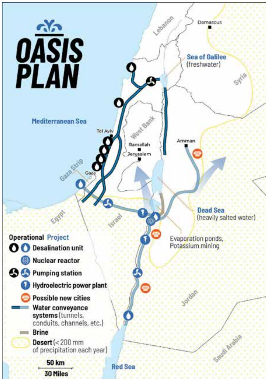
Some elements of the Oasis Plan.

Now, Helga, I think without question the leading developments are related to the danger of an escalation of the crisis in Gaza: Israeli Prime Minister Benjamin Netanyahu’s threat to break the ceasefire in Gaza, to go back to hunting down Hamas and committing genocide in the process; and then there’s President Donald Trump’s so-called “peace plan,” which involves a U.S. takeover of Gaza and the removal of 1.5-2 million Palestinians to Egypt or Jordan or some other location—this has been condemned by the vast majority of nations, including all of Israel’s Arab neighbors. The only positive part is when Mike Waltz, the National Security Advisor, said, if someone has a better plan, he’d like to hear it.