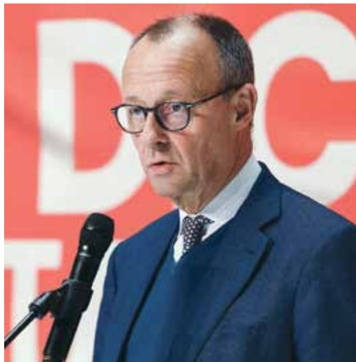
Friedrich Merz Facebook page

for profit’s sake, that which has brought the whole world to the edge of World War III, then that is this system of BlackRock, Vanguard, and the other asset managers; these are the people who profit from the stocks of the military-industrial complex. They have an interest to have one war after the other.