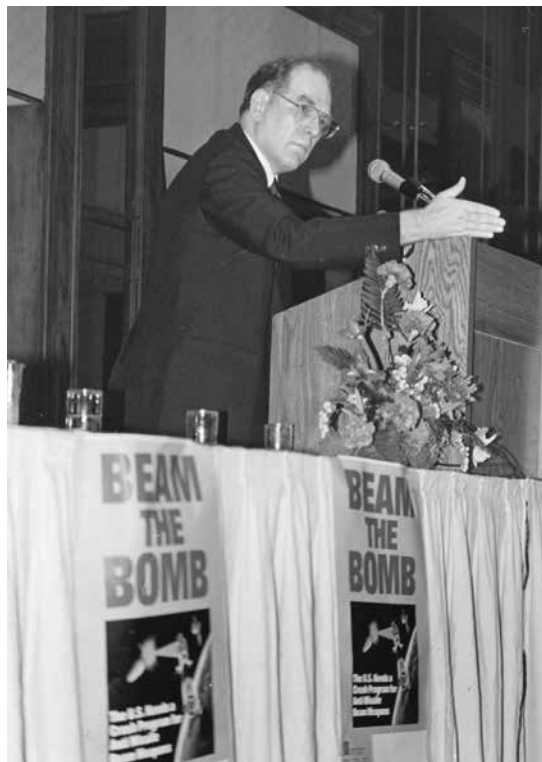
Lyndon LaRouche presents his beam weapons policy in April 1983.

the United States and the Soviet Union. This was premised on the view that there are common interests of Mankind around which a new security architecture can be built. The Trump proposal is notoriously based on the opposite view: seeking to impose the U.S.’s hegemonic position against hell or high water—both of which now loom on the horizon. (Emphasis has been added to the quotes below to highlight these distinctions.)