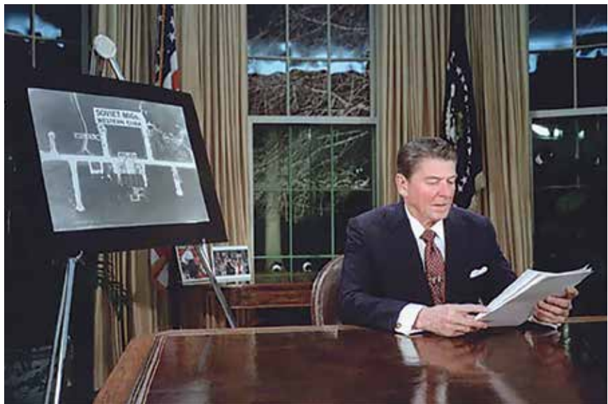
Ronald Reagan Presidential Library

LaRouche delivered a public address in Washington, D.C. two months prior to Reagan's SDI announcement, in which he explained his proposal for the use of new physical principles to radically transform the world security and development architecture: