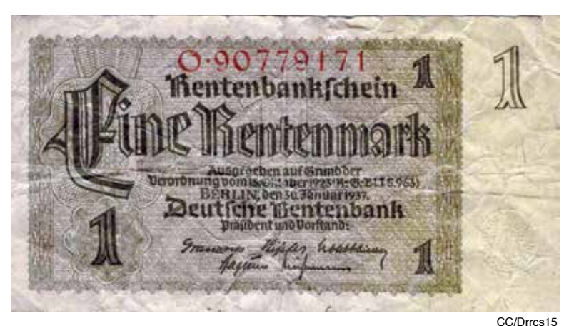
A one-Rentenmark note.

uation to be made on this point is that when Manhattan and London circles set Hjalmar Schacht's Hitler-project into motion, they transformed both Germany and Nazism, creating a curious symbiotic interdependency between the Nazi machine and German national economic and related interests. The result was that Germany's economic and related interests expressed themselves in the distorted forms possible within the framework of the Rentenmark and Mefo-Bill structures created by Schacht and administered by the Hitler apparatus.