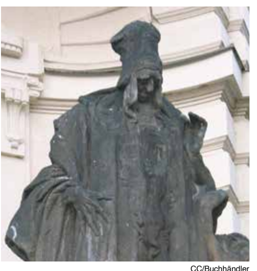
A monument to the fabled Rabbi of Prague.