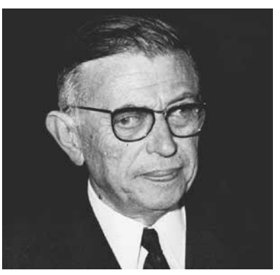
Jean-Paul Sartre