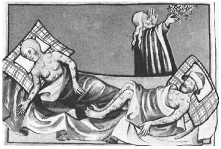
We are rocketing toward a New Dark Age, which will be much worse than what Europe experienced in the 14th Century with the Black Death. This illustration of the Plague is from the Toggenburg Bible, 1411.

If we do that, other nations will join us. I can assure you that Russia, China, and India will probably join us, if we do that! Now, we're demoralizing them. If we do