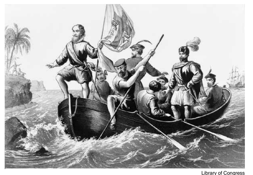
The landing of Columbus at San Salvador, Oct. 12, 1492. Columbus was part of Nicholas of Cusa's policy to found a nation-state free of the oligarchy. "We were formed, here, to escape from Europe, in order to bring the best of European civilization into a different continent... where it would be free of the corruption of Europe."

into South America, most notably. The effort was made in particular, beginning 1620 in Massachusetts, with the arrival of the Pilgrims, and then the later Massachusetts Bay Colony. The intention was—these were not refugees; these people who created this nation, were not refugees. They came here, to bring the best of European civilization to a new continent, where it would be free of the corruption of Europe! The moral and cultural corruption of Europe, which was largely the history of oligarchy!