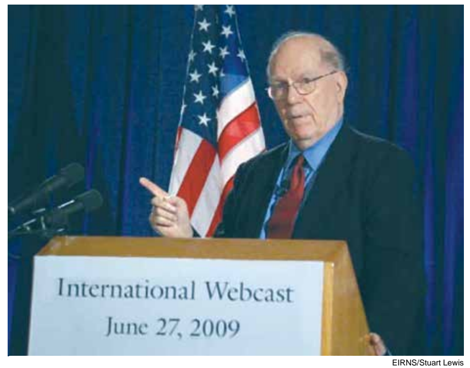
Since July of 2007, the world has been in the process of a general breakdown crisis, of the economy of the whole world, LaRouche stated, and now the situation is more desperate than it was before the Obama inauguration.

Editor's Note: This is a reprint from EIR , Vol. 36, No. 26, July 3, 2009, pages 4-14.