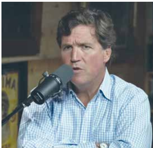
Tucker Carlson's Facebook page

Carlson reminded viewers of Trump's criticism of former U.S. President Joe Biden's decision to launch strikes against Yemen last Summer, when he said on Tim Poole's podcast, "Recently, they're dropping