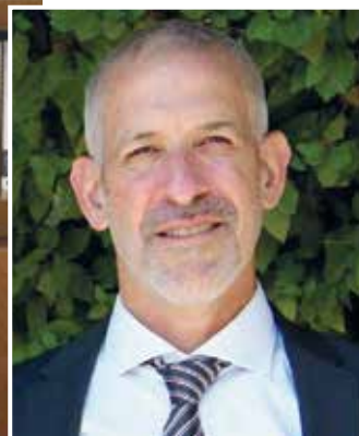
Shin Bet chief Ronen Bar, an inconvenient sleuth.

it falls on Netanyahu, who is being accused of scapegoating Bar to cover for his own failure. There is also the question of why, if Bar and the Shin Bet are to blame, has Netanyahu kept him as a leading advisor since October 7?