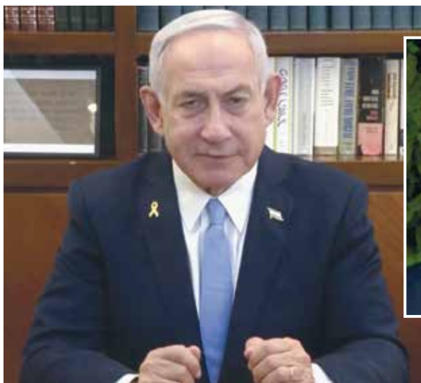
Israeli Prime Minister Benjamin Netanyahu is gambling on support from U.S. President Donald Trump.

Netanyahu's swift move to fire Bar is related to the other issues. Bar has been under attack for the failure of his security forces to provide advance warning of the Hamas attack. While it is still a matter of conjecture as to who bears responsibility for what all agree was a classic intelligence failure, some of the blame for