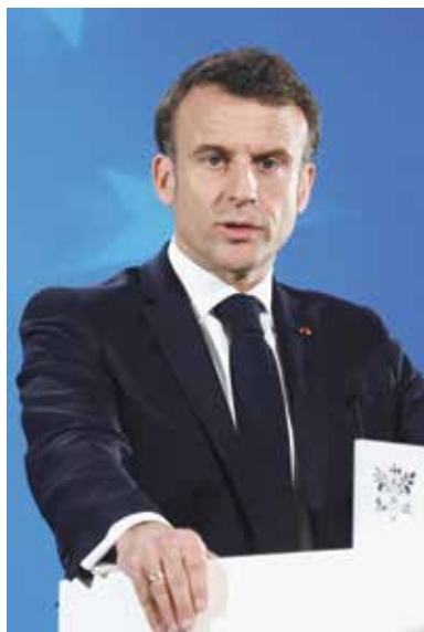
European Union French President Emmanuel Macron.