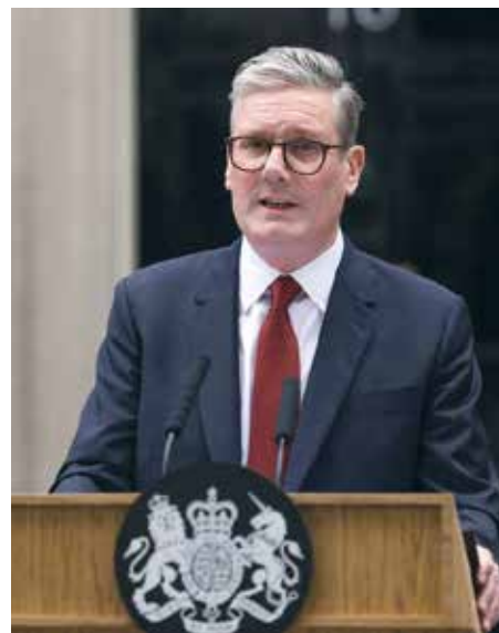
No. 10 Downing Street British Prime Minister Keir Starmer.

that it has already taken the lives of over one million Ukrainians and around 300,000 Russians.”