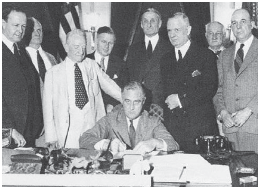
U.S. National Archives