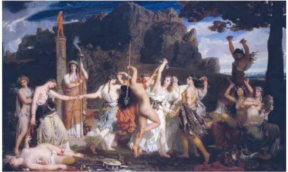
The Dance of the Bacchantes (Charles Gleyre, 1849). LaRouche: Oligarchist forces centered around the British monarchy condemned Moro to death and used their “countercultural forces of the modern Phrygian cults of the pagan god Dionysus” for the purpose.

Only on condition that governments direct and mandate their security forces to deal with the problem of