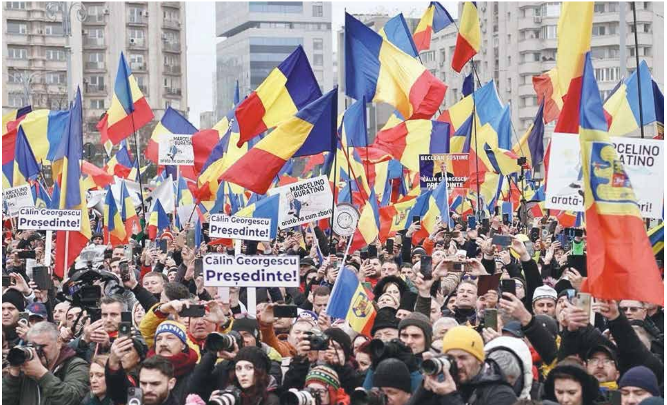
Călin Georgescu Facebook page

Călin Georgescu's supporters rally in support of their candidate.