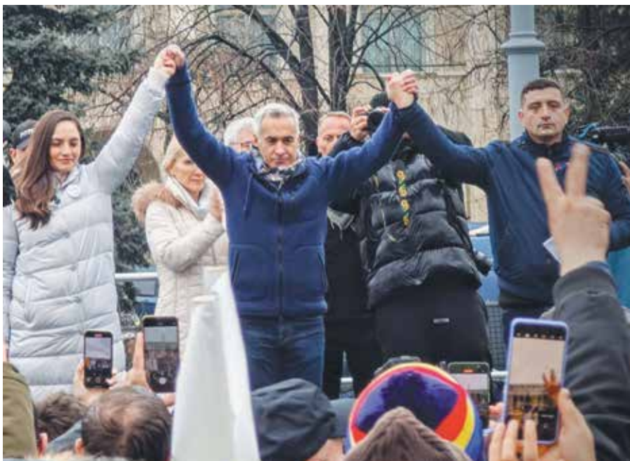
Călin Georgescu Facebook page

"The Călin Georgescu phenomenon," that is, his candidacy, election success, censoring, and his peaceful fight, has been a wakeup call for people. Under judicial supervision, Georgescu has stepped into the shadows, but the informal CG movement he inspired