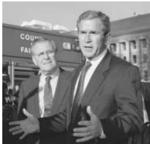
The 9/11 terrorist events deflected the neo-cons' campaign against China for only a short time. Less than a year later, Congressional and Pentagon reports sounded the alarm of an emerging Chinese threat. Here: The World Trade Center, and (inset) President Bush with Defense Secretary Donald Rumsfeld at the Pentagon on Sept. 12, 2001.

structure: The U.S. Air Force should consider the merits of increasing exercises in and rotational deployments of combat aircraft to Southeast Asia. . . . U.S. arms transfers and combined exercises could promote interoperability with ASEAN forces."