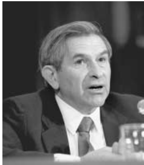
Britain's Prof. Bernard Lewis (left) introduced the concept of the "Clash of Civilizations," which is now being implemented as policy by the Bush Administration cabal that includes Deputy Secretary of Defense Paul Wolfowitz (right).

saw the opportunity to build their new Empire, but believed this required the creation of a new "enemy image," in keeping with this Straussian, Satanic sense of "human nature." The modern-day Straussians found their enemies in Islam, and in the Confucian culture of China.