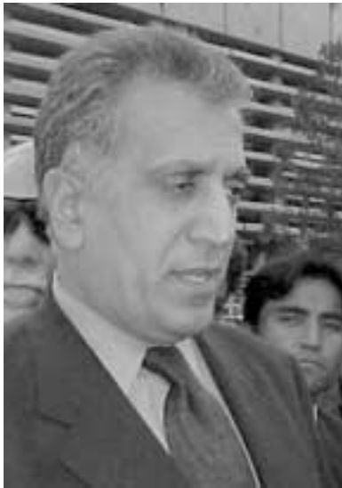
U.S. Special Envoy for Afghanistan Zalmay Khalilzad. In 1999-2000, he directed a series of RAND Corp. studies on "Chinese Defense Modernization and Its Implications for the United States Air Force."

For example: Cohen's proposed solution to the problem was for the United States to "offer to help Russia and China counter the efforts of radical Islamic groups in Central Asia, including the Taliban and the Osama bin Laden organization. . . . Beyond such efforts, it should ask to join the SCO as an observer, to examine how sincere China and Russia are about cooperation in dealing with Islamic fundamentalism."