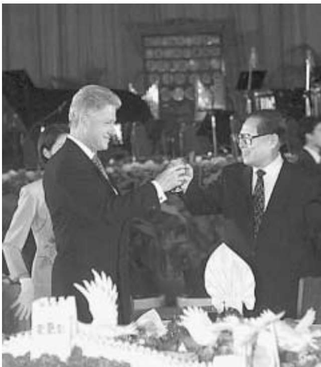
President Clinton's diplomatic initiatives toward China sent the neo-conservatives into a frantic counter-mobilization, which included the President's impeachment. Here he is shown with Chinese President Jiang Zemin in Beijing in 1998.

Commerce Secretary Ron Brown, during his 1994 trip to China with a delegation of American industrial leaders: "We regard China as a commercial ally and a partner—that China's long history is deserving of respect; and China has responded." Most importantly, Brown said that Clinton had "junked a 12-year tradition of laissez-faire government." This Administration was not simply looking for a "level playing field," Brown said, meaning free-trade agreements aimed at consumer goods and financial services, but at major industrial and technological cooperation between the United States and China. "In this mission, we focus on infrastructure . . . , telecommunications, transportation, and power generation."