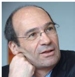
French Labor Minister Eric Woerth is in charge of austerity against retirees, among others.

So, the government is very weakened, and the people are angry. And anger sometimes can explode over a small thing, like the case of Woerth: Woerth did nothing other than to act according to the rules of the game, to get as much money as he could for his party and the operations of his government, on orders of Sarkozy. People are saying, “The scandal is the Woerth/Bettencourt/Sarkozy scandal.” It’s not “Bettencourt,” it’s not “Woerth/Bettencourt,” it’s also “Sarkozy.” And people are seeing that more and more.