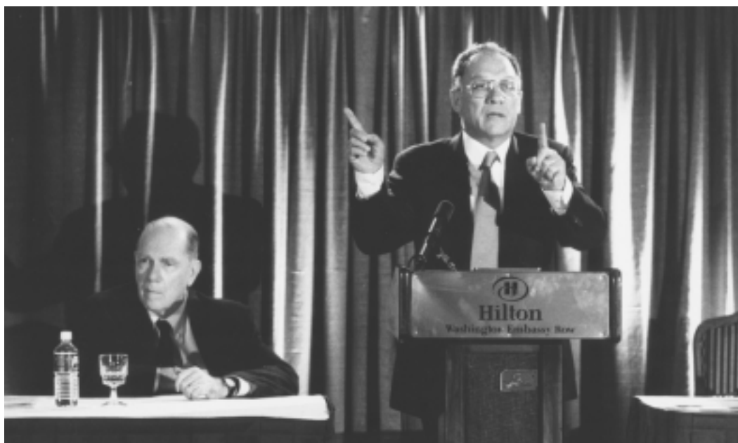
General Bedoya with Lyndon H. LaRouche, Jr., Feb. 23, 2000, at a conference in Washington sponsored by LaRouche's Committee for a New Bretton Woods.

increasingly impoverishing the people with higher taxes. The United States knows this perfectly, because Wall Street and the U.S. Federal Reserve have to know exactly what is going on in Colombia from the economic point of view.