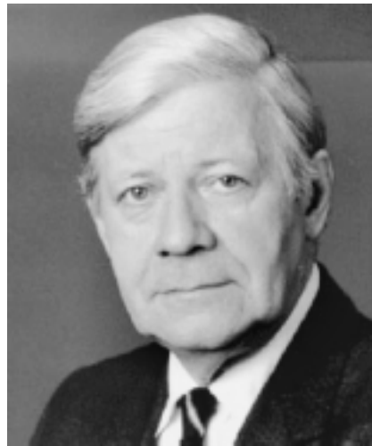
Former West German Chancellor Helmut Schmidt wrote to Tietmeyer in 1996: "Did not the administration of the Reichsbank, your predecessors, already once before in 1930-31-32, plunge us into the misfortune of mass unemployment, with grave political consequences?"

Helmut Schmidt, back in 1996, maintained that the continuing high-interest-rate policy of the Bundesbank under Tietmeyer, and the ensuing international high value of the deutschemark, were primarily responsible for the increase in German labor costs. Schmidt identified these policies, instead of German labor production costs being too high, as some claimed, as the real reason for the debate initiated by some industrialists about "production costs being too high in Germany." Because of the continuing high-interest-rate policy of the Bundesbank under Tietmeyer, and the up-valuation of the deutschemark—forced through with the argument that the deutschemark was a "strong anchor currency"—"entire