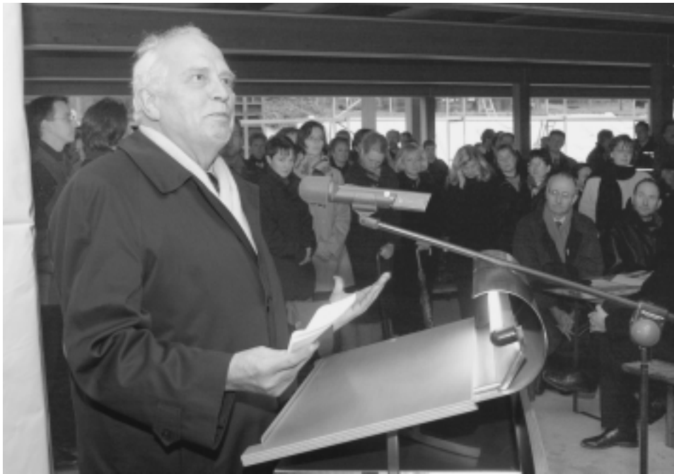
Hans Tietmeyer is President of the Board of Trustees of the New Social Market-Economy Initiative, a propaganda arm for privatizing what has been the German government's role in regulating banking, health care, and social security, for example. Tietmeyer was President of the Bundesbank (Central Bank) in 1993-99, and became Vice President of the Bank for International Settlements, and a member of the advisory board of Lazard Frères Germany, in 2003.

and the financial world, which mobilized against the only way out of the economic depression—the Lautenbach Plan for expanding credit for industry, infrastructure, and jobs. Schacht and his supporters in Germany acted on behalf of their international sponsors, the financial circle around Montagu Norman of the Bank of England, and Franklin Roosevelt's opponents in America like the families of Morgan, Mellon, Harriman, and Prescott Bush—grandfather of the current American President.