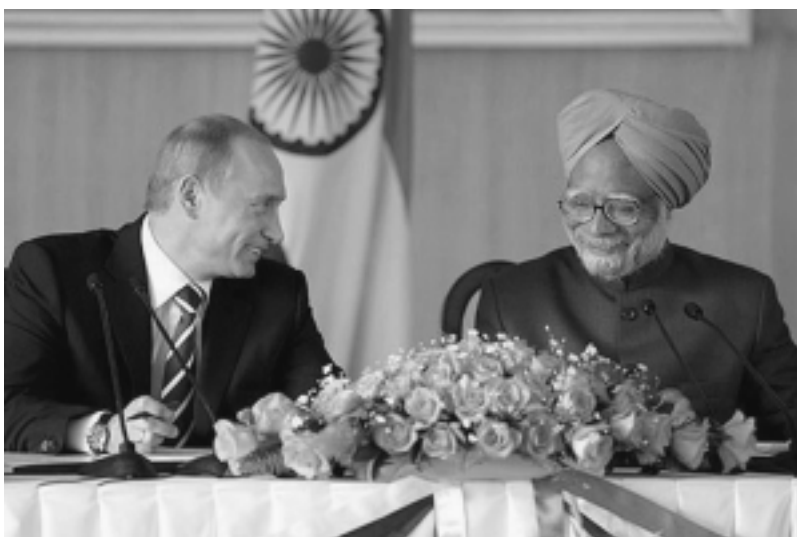
Russian Presidential Press and Information Office

Russian President Vladimir Putin has repeatedly emphasized his desire for cooperation with the United States, and would be ready to enter into a four-nation cooperative alliance with the U.S.A., India, and China. But he needs a partner in Washington who shares that perspective. Here, Putin appears with Indian Prime Minister Manmohan Singh, in New Delhi on Jan. 25, 2007.