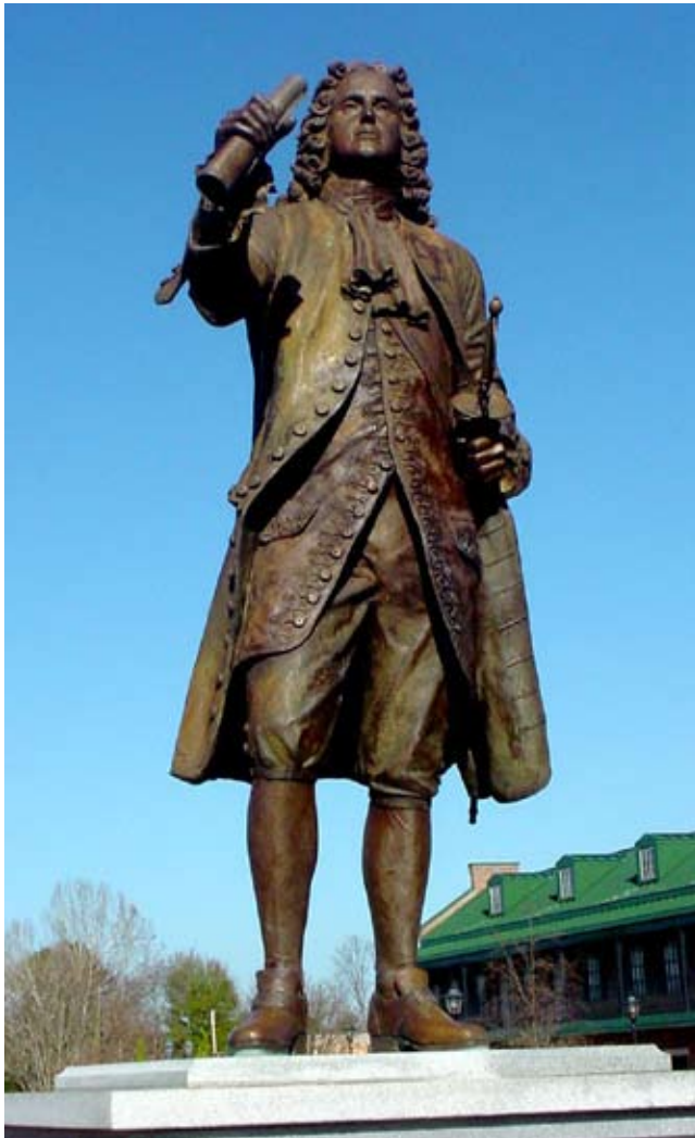
James Edward Oglethorpe, founder of the colony of Georgia, succeeded in banning slavery in the colony, by outfoxing the British imperial oligarchs, who were intent on crushing the infant American Republic in the cradle. Here, Oglethorpe's statue, in Augusta, Ga.

as a mere footnote in history. The story of Georgia is important, not in and of itself, but in its contribution to the understanding of what the New World—America—was!