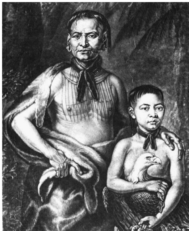
Oglethorpe befriended the Yamacraw leader Tomochichi (shown here with his nephew Toonahowi in an 18th-Century engraving), who presented him a gift of a Bison skin, with an Eagle painted on the inside. The Bison signified strength, Tomochichi explained, and the Eagle, swiftness; but, the Bison skin could provide protection, and the Eagle feathers were soft; and signified love. Thus, the same strength which the English used to crush the Native Americans, could also be used to love and protect them.

But, Oglethorpe also found that operations had been run, to turn Native Americans against him. In May, he wrote: